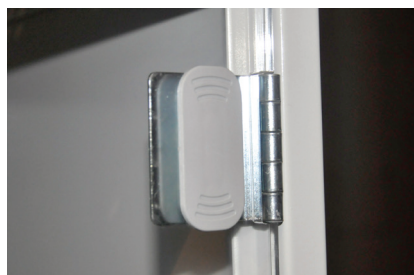
Zinc Plated 40mm Butt Hinge